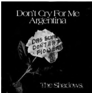
Das Schnitz 4am EP Three of multiple versions [see also page 28] Ellie Jay Records, EJSP9246, 1979 Designer: group member

Quite a number of regional groups did make the transition to the major labels, in part following the success of self-released records on smaller independent labels, or through the efforts of the majors to secure some financial investment in the subculture before it vanished. Did this lead to a tempering of creativity? In many ways, yes it did, and this can be seen in the glossier production values of records, and in the loss of individuality in the design of the packaging itself. Mass production inevitably leads to some dilution of those design quirks we could associate with a hand-made, DIY aesthetic. Sleeves such as the Das Schnitz EP that you mention, or the debut single by The Atoms (which featured two hand-cut sleeve boards, each silkscreen printed in four colours, xeroxed inserts and hand-cut