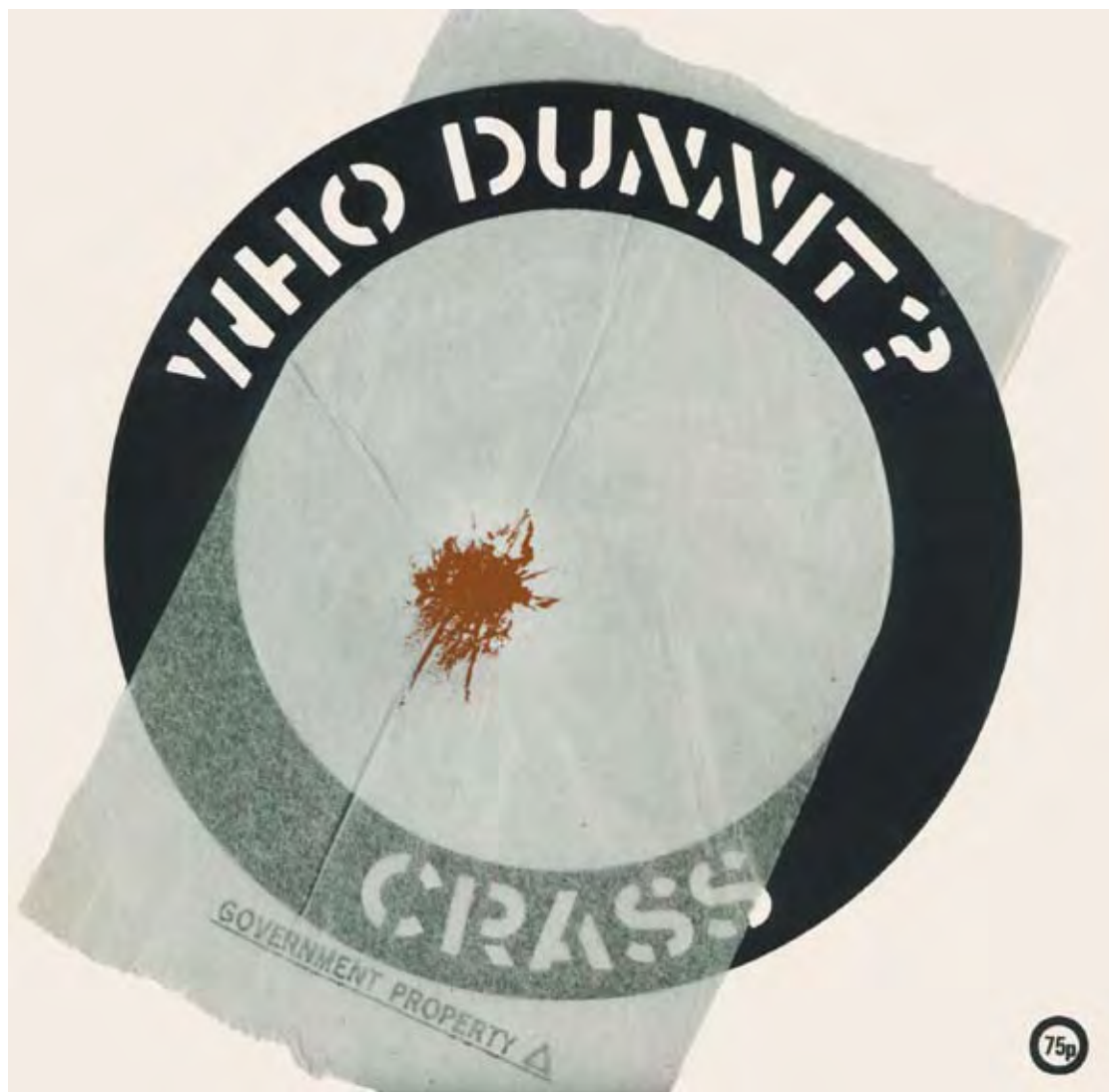
Crass Who Dunnit? Crass, 121984/4, 1983 Designer: Gee Vaucher