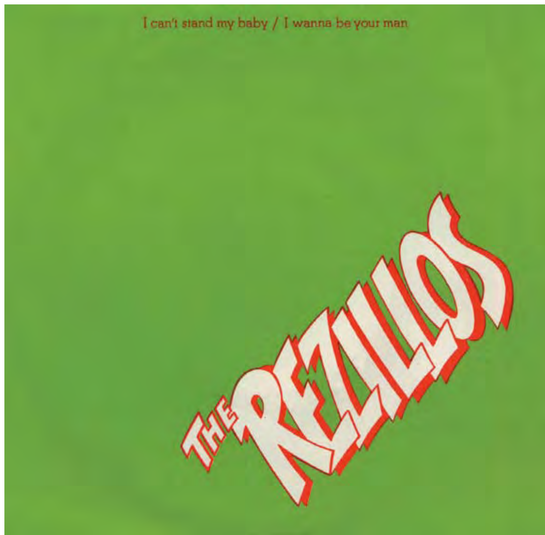
The Rezillos I Can't Stand My Baby Sensible Records, FAB1, 1977 Designer: unknown