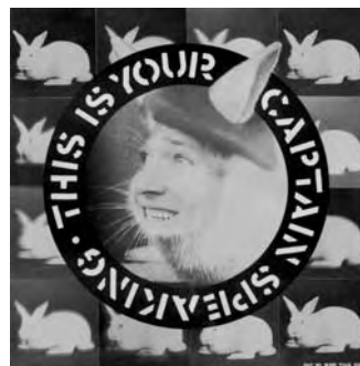
Anorexia Rapist In The Park Slim Records, SJP812, 1980 Designer: group member