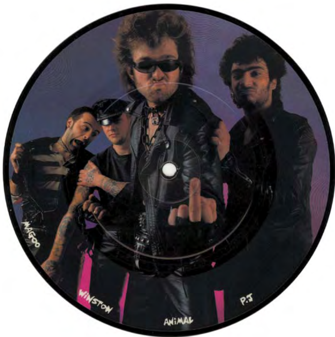
The Anti-Nowhere League Woman (picture disc version) WXYZ, ABCDP4, 1982 Designer: unknown