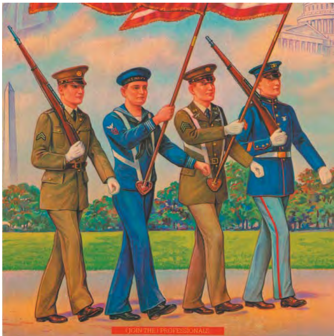
The Professionals (Join The) Professionals Virgin, VS426, 1981 Designer: unknown