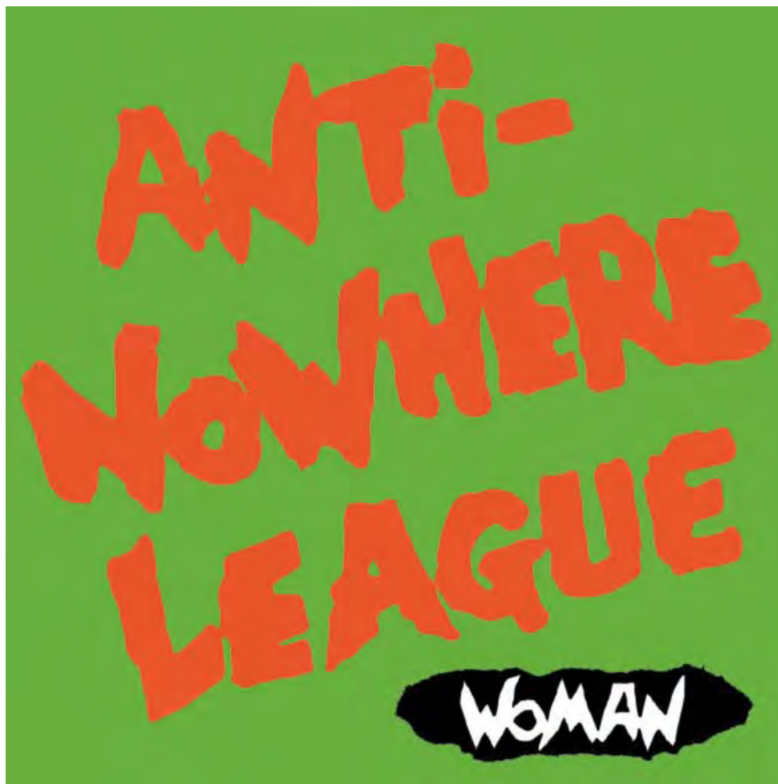
The Anti-Nowhere League Woman WXYZ, ABCD4, 1982 Designer: unknown