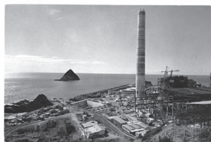
fig. 4: New Plymouth Power Project, Taranaki Gladys M. Goodall, Felicity Card Co. Ltd. / Whitcombe and Tombs Ltd. fig. 5: The Savage Memorial, Tamaki Drive, Auckland Gladys M. Goodall, Fourcolour Productions Ltd., Auckland fig. 6: Pioneer Motel, Pioneer Highway, Palmerston North Bascands Ltd., Christchurch fig. 7: Trans Holiday Hotel, Queenstown Bascands Ltd., Christchurch

First, many of the photographs employ strict grid-based principles of composition (reflecting the kind of clean modernist aesthetic exemplified by architect Gordon Smith’s landmark civic buildings in Wanganui, shown in card (fig. 3). In card (fig. 4), the large New Plymouth power plant construction site is neatly framed by a slight rise in the foreground and the expansive Tasman Sea behind it. The horizon runs the full width of the card, precisely and completely bisecting the shot. One of the small offshore Sugarloaf island sits one third of the card’s width from the left